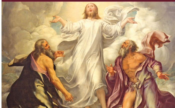
While he was still speaking, a cloud came and cast a shadow over them, and they became frightened when they entered the cloud. Then from the cloud came a voice that said, "This is my chosen Son; listen to him." - Lk 9:34-35

PARISH PASTORAL COUNCIL MISSION STATEMENT As disciples of Jesus Christ serving on the Parish Pastoral Council, we collaborate with the Pastor and Staff inviting the people of St. John the Evangelist Church to joyfully celebrate the Eucharist, faithfully teach Catholic tradition, and fervently form Catholic spirituality, so that together we may go forth in love to serve the Lord and each other.