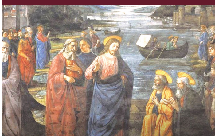
Jesus summoned the Twelve and began to send them out two by two and gave them authority over unclean spirits. The Twelve drove out many demons, and they anointed with oil many who were sick and cured them. - Mk 6:7, 13