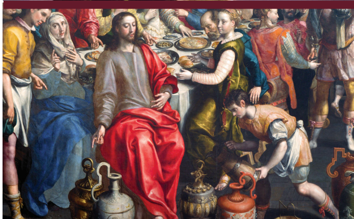
There was a wedding at Cana in Galilee, and the mother of Jesus was there. Jesus and his disciples were also invited to the wedding. When the wine ran short, the mother of Jesus said to him, "They have no wine." - Jn 2:1-3